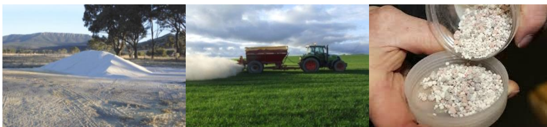
Figure 2. Conventional field techniques will not appropriate for materials storage and achieving soil benefits, so materials processing is a marketing option.

We highlight that time frames for market establishment will extend into following decades. Time frames of ten years or longer will be needed to demonstrate the practical applications by field trials and also establish the product distribution networks. In real terms the rate of farmer acceptance will be based on the favourable outcomes from field trials as plant yields are matched to cost effectiveness, which may take several seasons or years to establish.